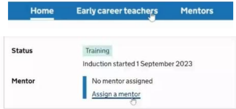
Image – assigning a mentor on DfE site

Check back to the DfE 'manage training for early career teachers' website to ensure you assign mentors for all your ECTs and also to check the eligibility of your ECTs, by clicking on 'Early Careers Teachers' on the top bar of the website and clicking 'assign mentor'.