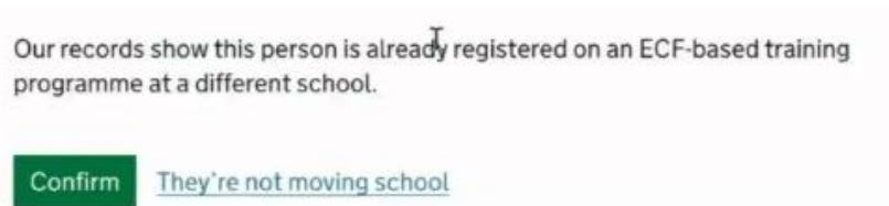
Image – message on DfE site if a participant is moving schools

If an ECT is joining you from another school and they have already started their ECF induction elsewhere; you follow the same process but will be asked to confirm they are moving schools.